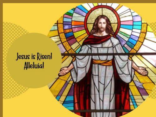
Jesus was buried